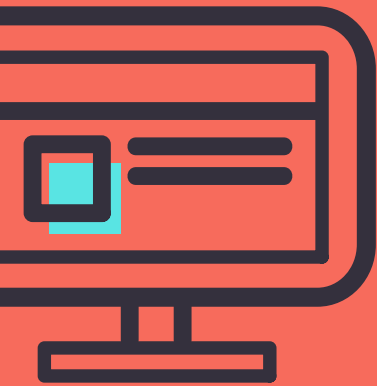
Image sharing or exams made on forms It is always possible to abuse.

MANY INSTITUTIONS AND ORGANIZATIONS IN OUR COUNTRY USE FREE TOOLS FOR ONLINE EXAM MANAGEMENT, CAUSING OUR NATIONAL DATA TO BE EASILY EXPORTED ABROAD.